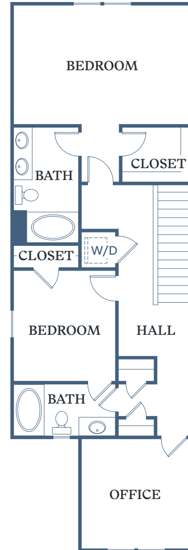
2 ND FLOOR – 856 SF

Information is believed to be accurate, but not warranted. Specification, pricing and availability are subject to change without notice. See agent for details. Artist's renderings and floorplans are approximate only and are not meant to be exact depictions of the unit. Drawings are not to scale. Your selected floorplan may vary from this illustration due to design configuration and architectural styling. Not all features are available in every apartment. All square footages are approximate.